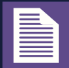
Wills, Trust and Probate