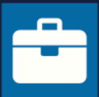
Company and Commercial